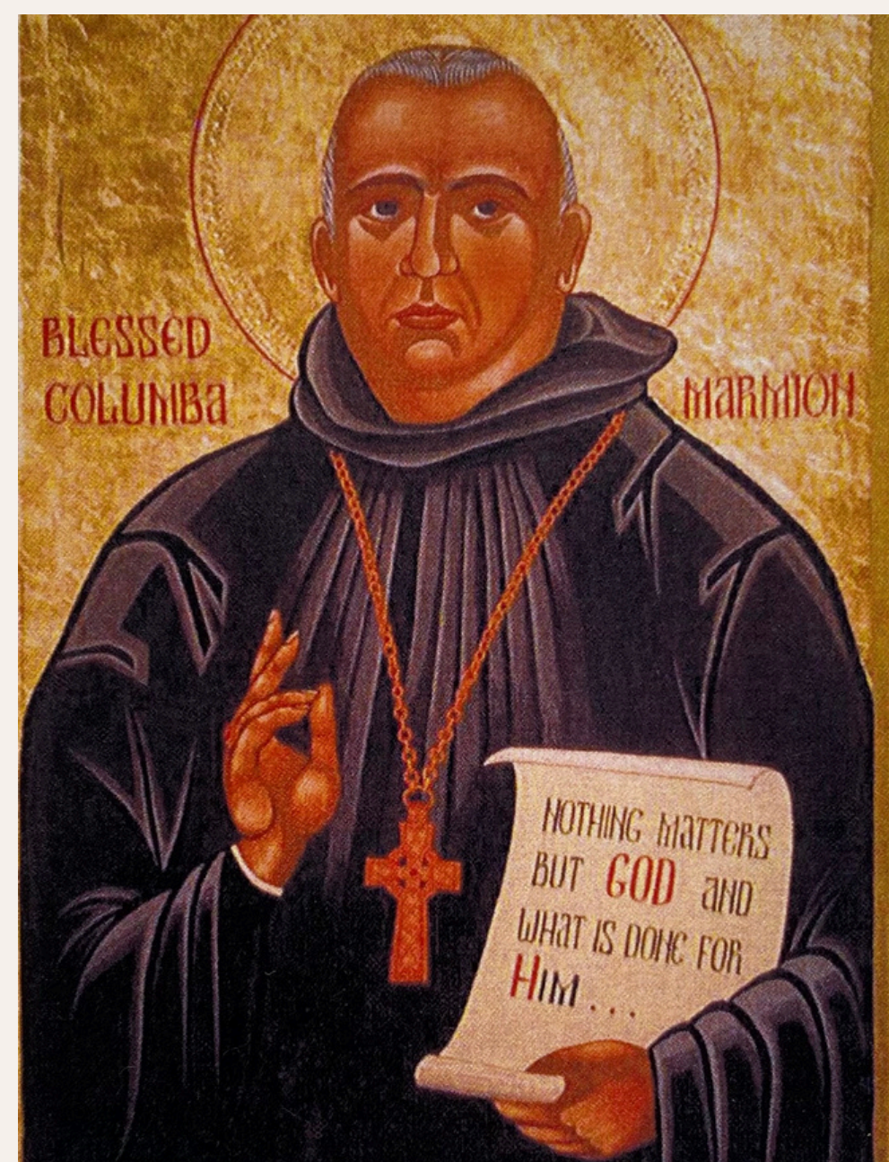
Blessed Columba Marmion of Dundrum