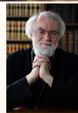
Reflection Archbishop Rowan Williams