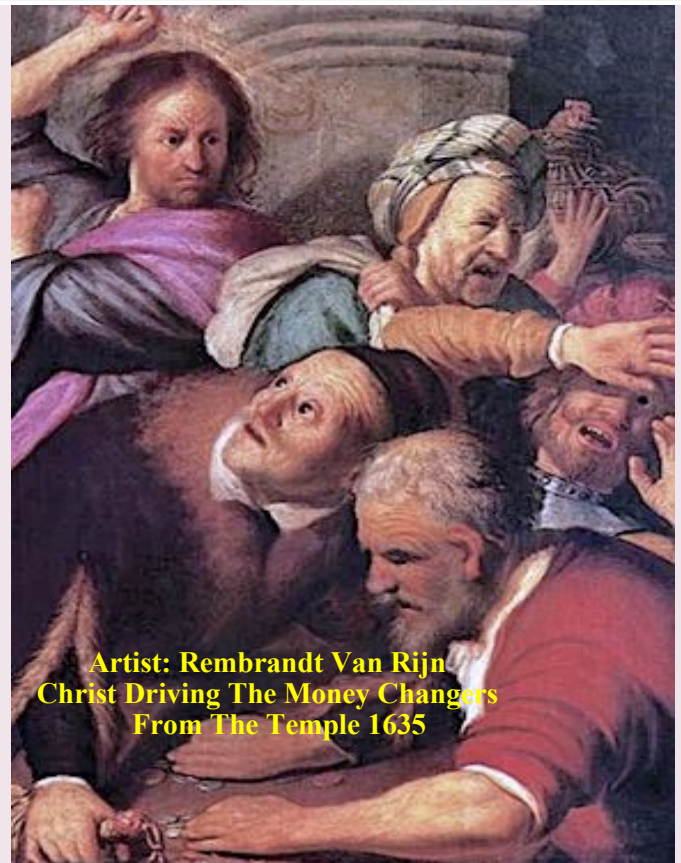
Artist: Rembrandt Van Rijn Christ Driving The Money Changers From The Temple 1635