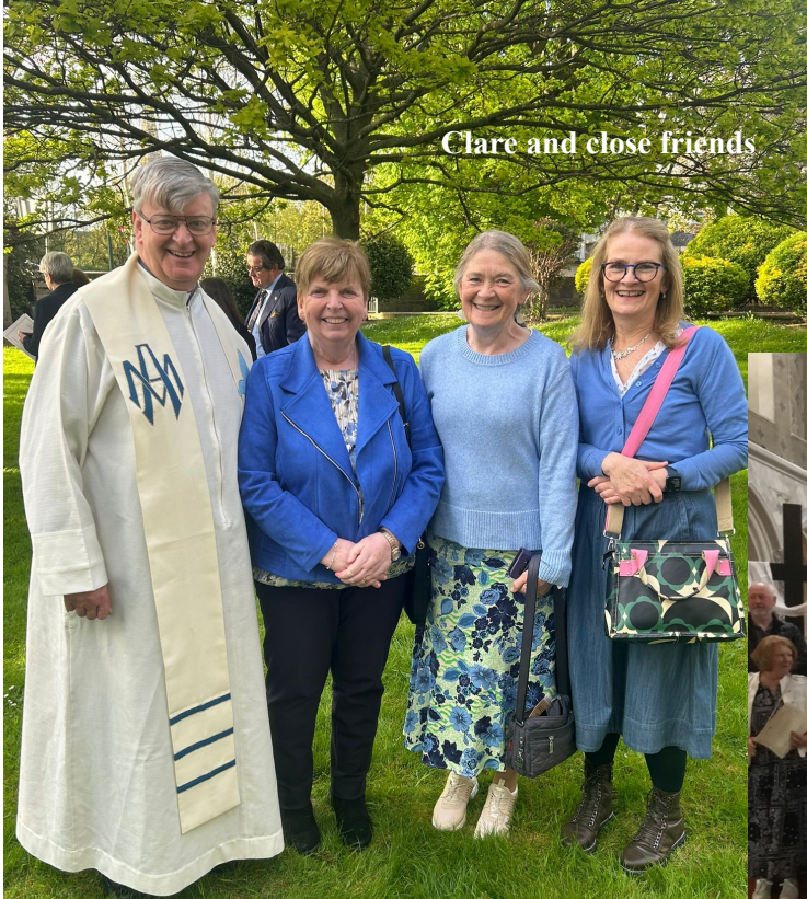
Clare and close friends