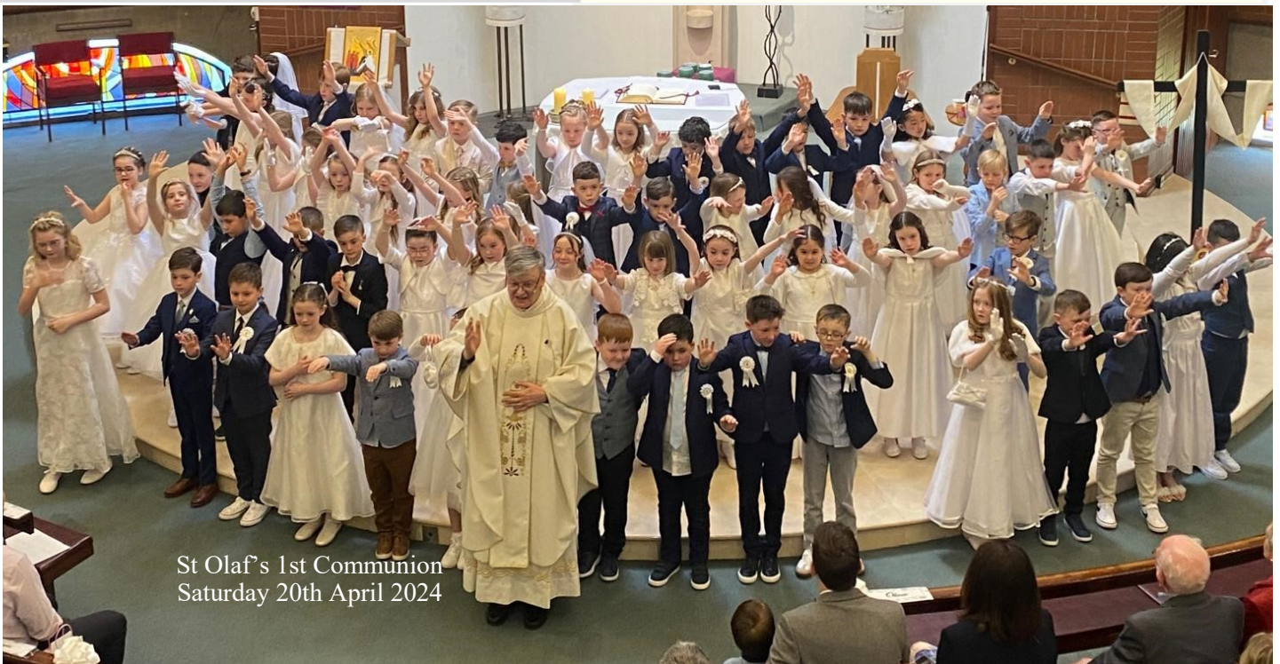
St Olaf's 1st Communion Saturday 20th April 2024