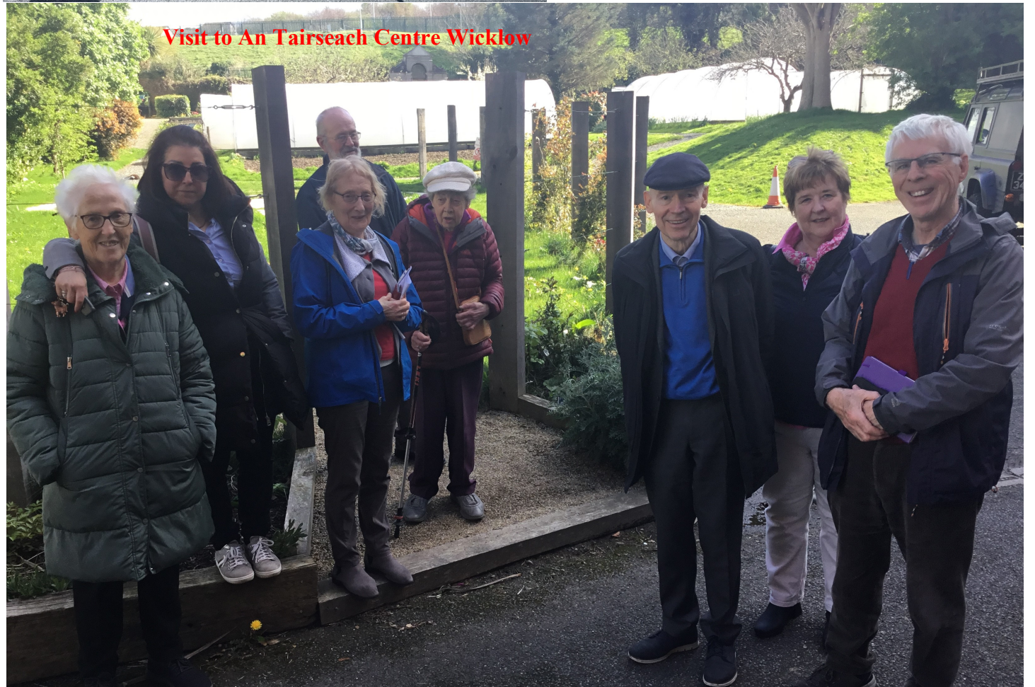
Visit to An Tairseach Centre Wicklow