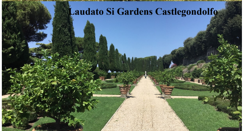
Laudato Si Gardens Castlegondolfo